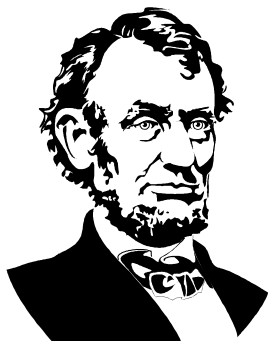
Celebrate 200 Years

Happy New Year to all our members and friends,